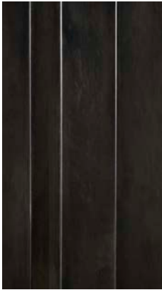
Black Iron "Genere"